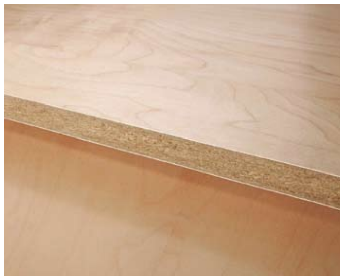
Columbia Forest Products and BuildingGreen.com

The Green Chemistry Initiative should ensure that manufacturers identify and prioritize safer alternatives to many different varieties of toxic chemicals, much as Columbia Forest Products has done with formaldehyde-based adhesives.